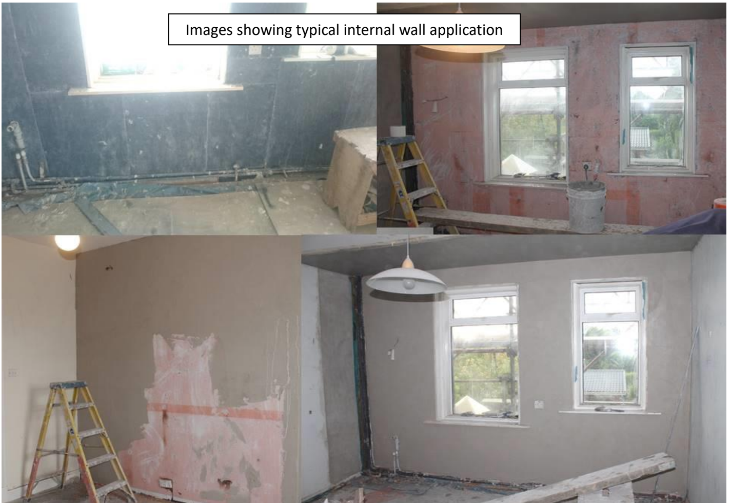
Images showing typical internal wall application